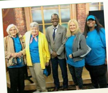
"Good Day Sac" Filming

The methods we use to ensure we're meeting residents' social, physical and mental needs include activity assessments, regular check-ins, 1-on-1 apartment visits, and monthly community meetings where we encourage resident feedback.