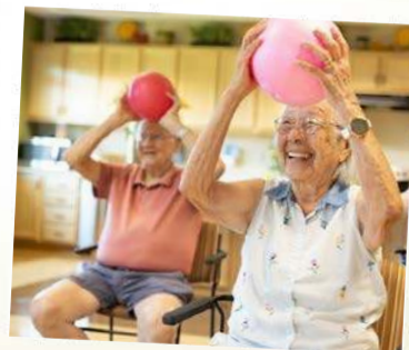
Staying Active & Engaged