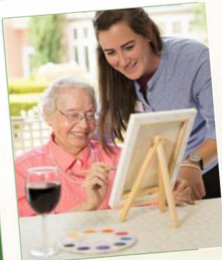
Paint & Sip Party

The methods we use to ensure we're meeting residents' social, physical and mental needs include activity assessments, regular check-ins, 1-on-1 apartment visits, and monthly community meetings where we encourage resident feedback.