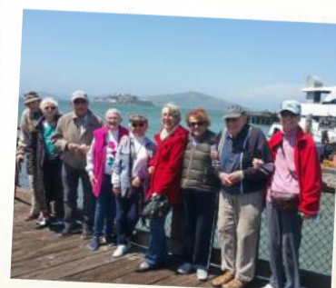
Exploring Pier 39