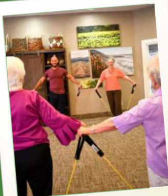
Live 2 B Healthy

The methods we use to ensure we're meeting residents' social, physical and mental needs include activity assessments, regular check-ins, 1-on-1 apartment visits, and monthly community meetings where we encourage resident feedback.