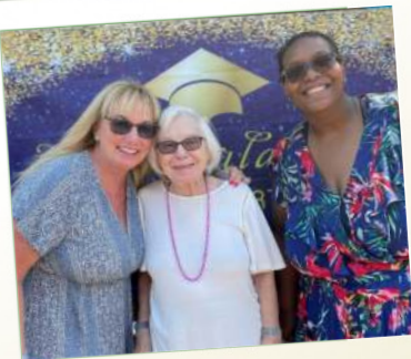
"Carlton University" Graduation

The methods we use to ensure we're meeting residents' social, physical and mental needs include activity assessments, regular check-ins, 1-on-1 apartment visits, and monthly community meetings where we encourage resident feedback.