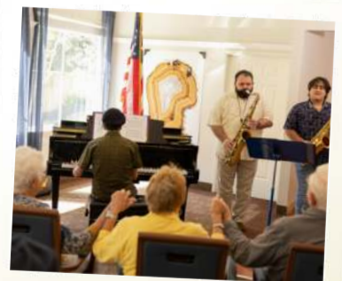
Music by Midtown Jazz