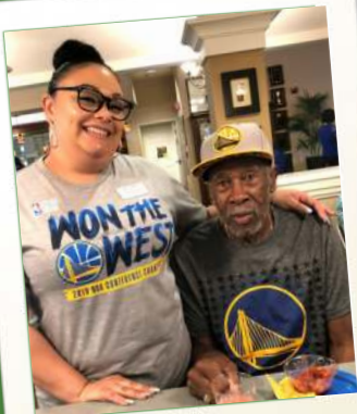
Team Spirit Day

The methods we use to ensure we're meeting residents' social, physical and mental needs include activity assessments, regular check-ins, 1-on-1 apartment visits, and monthly community meetings where we encourage resident feedback.