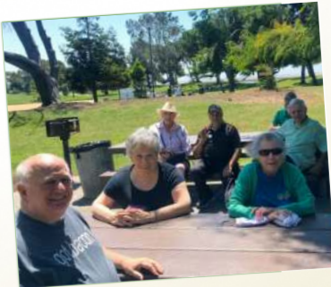
Picnic at the Marina

At Carlton Senior Living, we take pride in our Personal Expressions activity program. Our resident-tailored programming includes a variety of activities, special events, live music, discussion groups, outings, volunteering and much more.